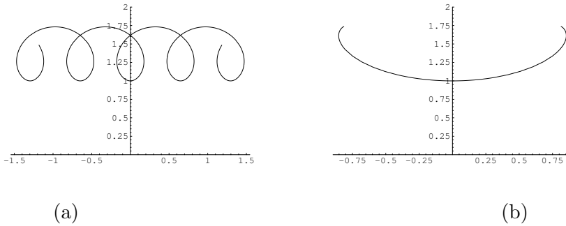
Figure 3: The generating curve of a parabolic surface with aH + bK = 1 , with 0 < a < 1 and a + 2b > 0 . Here z_0 = 1 and a = 0.5 . In the case (a), b = -0.2 and in the case (b), b = 0.3 .